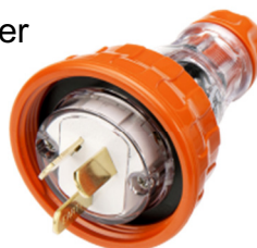
20 Amp plug with collar